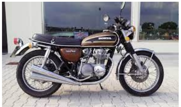
A similar Honda 500/4

In late 1976 I got a job as a motorcycle courier for a printers in Diss Norfolk. The regular rider had been banned for 6 months so I was taken on for that period. The company provided the motorbike; a Honda 500 Four and riding leathers. The pay was good so I thought I was doing well, getting paid to ride a nice motorcycle.